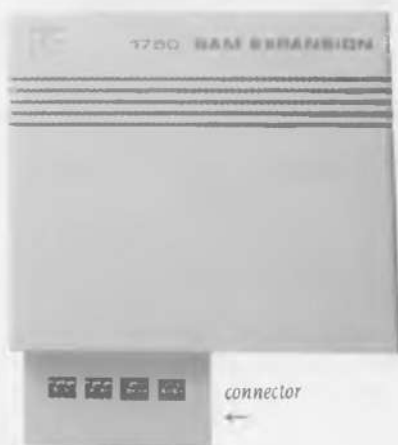
Figure 2-1. The RAM expansion module