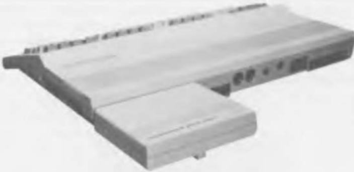
Figure 2-3, RAM expansion module installed