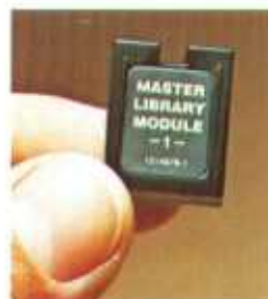
Revolutionary plug-in Solid State Software™ module—developed by Texas Instruments for the TI Programmable 59 calculator.