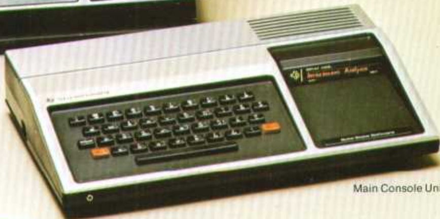
Main Console Unit