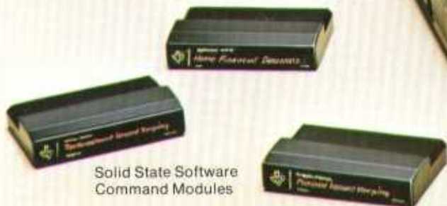
Solid State Software Command Modules