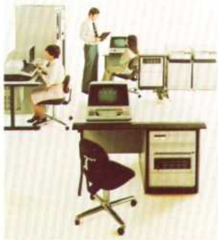
DS 990 business systems.

Texas Instruments has been deeply involved in computers almost since the modern electronic computer was born. Throughout the years, TI has provided the building block components that have paced computer technology. TI built its own first computer in 1953 to aid in geophysical exploration. Today, TI is one of the top manufacturers of mini and microcomputer systems and computer terminals. At the other extreme, TI's Advanced Scientific Computer is among the most powerful in the world.