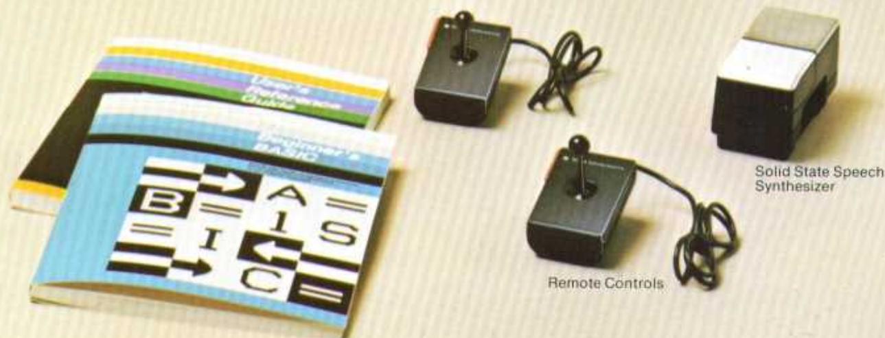
Solid State Speech Synthesizer

An RS-232 peripheral adaptor — A standard all-purpose communications link. Permits you to interface a wide range of computer accessories to your TI Home Computer. These accessories, available from a number of manufacturers, range from remote keyboards to impact printers, printing terminals, digitizers, plotters, modems, CRT's and more.