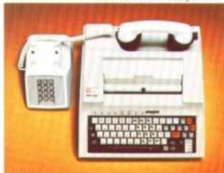
765 portable bubble memory data terminal.