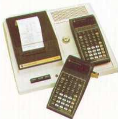
TI Programmable 58 and 59 calculators and PC-100C thermal printer/plotter.

TI has applied its best insights into today's technology and the direction of future technology to design a system which will grow in value and usefulness over the years. And you will grow with your home computer as you become familiar with it. You'll find that discovery of new potential—both personal and business—is one of the most exciting aspects of owning one. The quicker you and your family begin the adventure of exploring the emerging new era of the home computer the sooner you'll all start benefiting from this revolution.