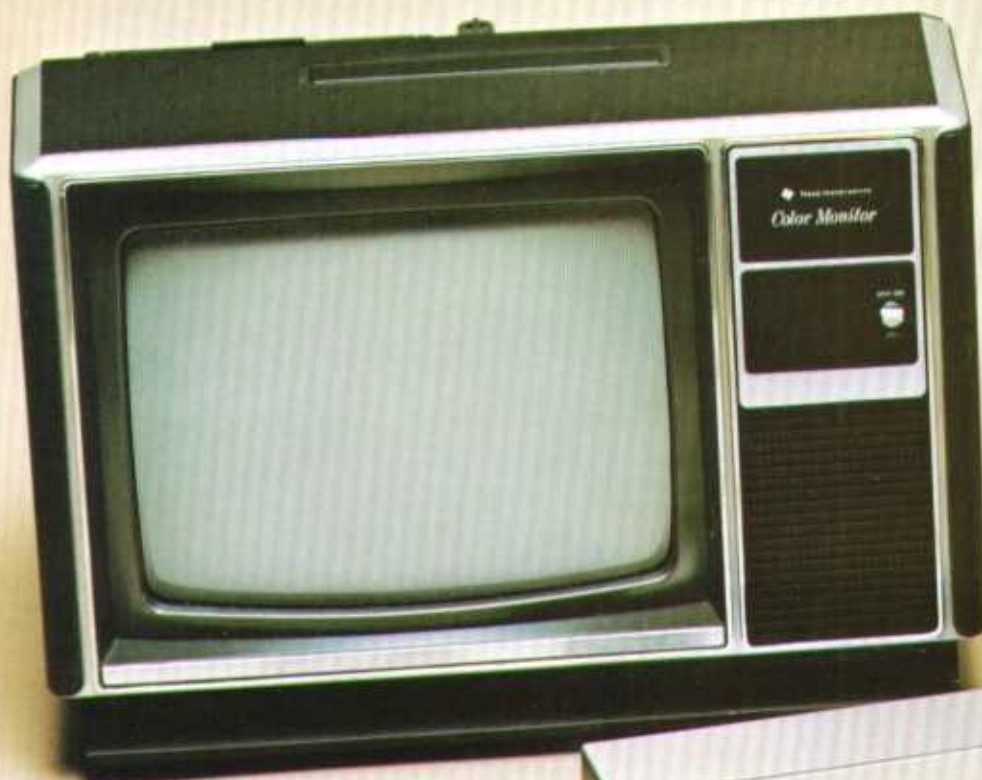
Color Video Monitor

Texas Instruments Solid State Software Command Modules are plugged into the special port provided on the front of the console. A dual cassette connector is located on the rear of the console. One or two audio cassette recorders can be connected to the TI Home Computer, enabling you to store information or programs for later use.